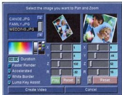
By popular demand, all Applied Magic Academic Packages will include Pan & Zoom and Chroma Key after October 1, 2002

Many teachers and students are expressing enthusiastic interest for the Chroma Key and Pan & Zoom special effects packages. With this in mind, we will be replacing the current Digital Juice NLE package with Chroma Key and Pan & Zoom special effect packages effective Oct. 1, 2002.